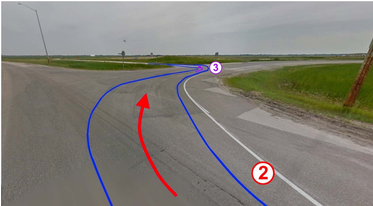
Figure 4 – Turn right off Hwy 230 onto Aviation Blvd and then take an immediate left turn onto George Porayko Way, which is a gravel road