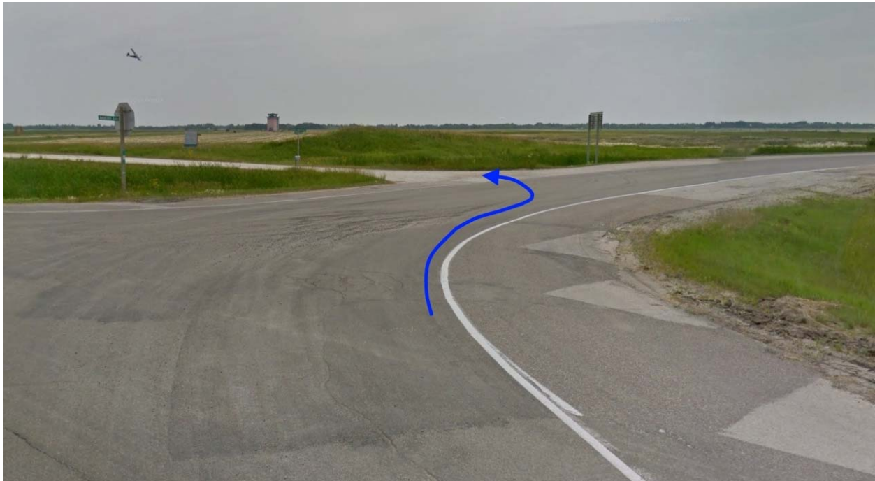
Figure 5 – This image shows how close the gravel road is to the intersection