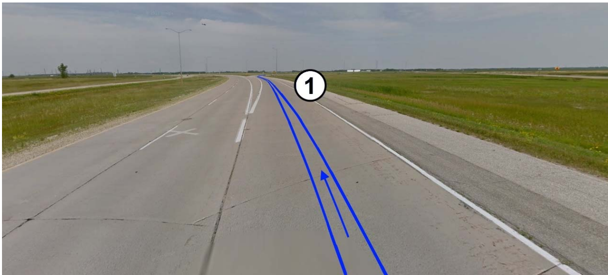
Figure 2 – Take the exit from Hwy 8 onto Hwy 230 (aka McPhillips Rd)