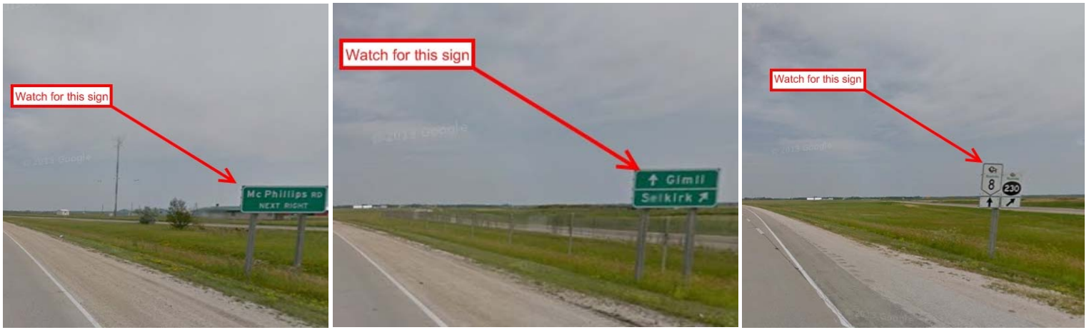
Figure 1 – Watch for road signs that indicate the exit from Hwy 8 to Hwy 230 is coming up