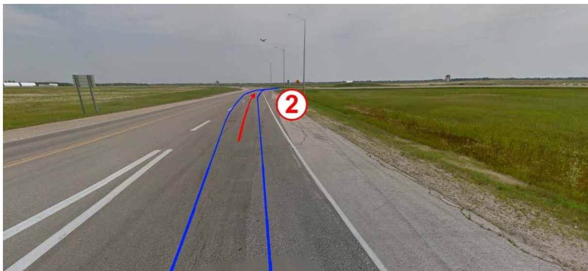
Figure 3 – Merge onto Hwy 230 and get ready to turn right again very soon – in only 450 m